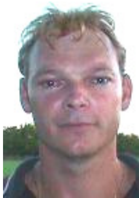
"I'm so tough I use aftershave...before!!"

What is black and red and white all over? Two Essendon fans after a talcum powder fight...aah, work with us here!