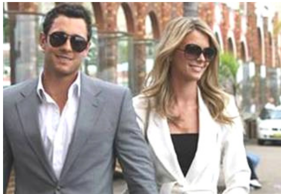
“Hello, I’m so stupid even blondes and Americans tell jokes about me!”