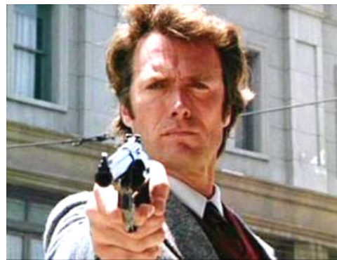
"It's not a ten-for, but my six-for right here should do the job!"